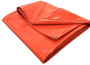
Extra: Groundsheet with eyelets