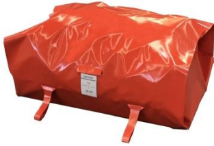
Hold-all with two lifting loops