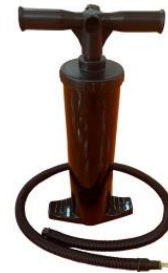
Extra: Double-stroke hand pump