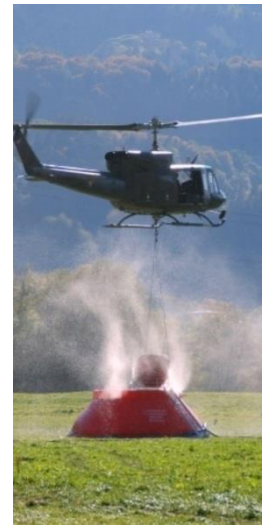
In use for helicopter bucket filling