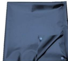
Extra: protective ground sheet