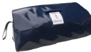
Holdall with two carrying loops